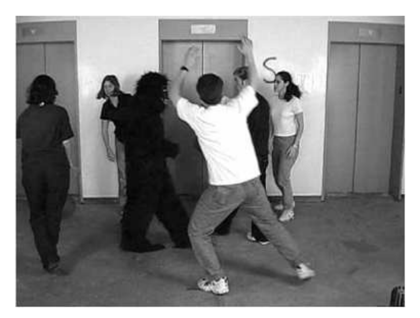
Figure 3. Gorilla walking through basketball passing experiment (from Simons & Chabris, 1999).

To demonstrate the significance of ecological information one only needs to look at what is called "change blindness." In a number of studies change blindness has been demonstrated when very large and significant visual events can occur and be totally missed by an active viewer. For example, participants asked to watch a group of people and count the number of times the ball was caught by person wearing a certain color shirts, missed a woman walking through the scene carrying an umbrella (Neisser, 1975; Neisser, 1979) or a man walking through the scene dressed in a gorilla suit (see Figure 1 below) over half of the time (Simons & Chabris, 1999). This phenomenon has also been labeled inattentional blindness (Simons & Ambinder, 2005).